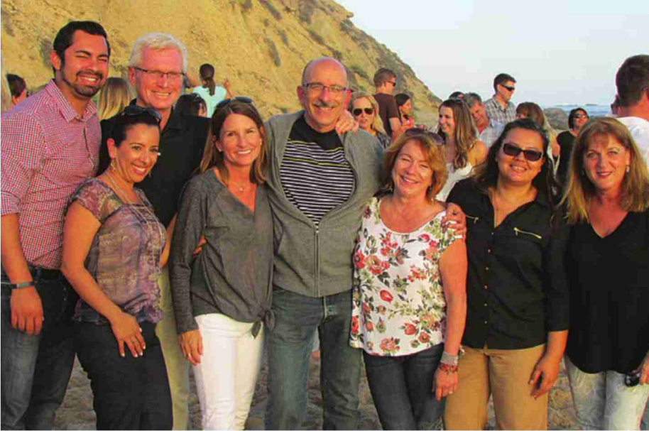
Burnham Benefits 20th Anniversary Employee Symposium